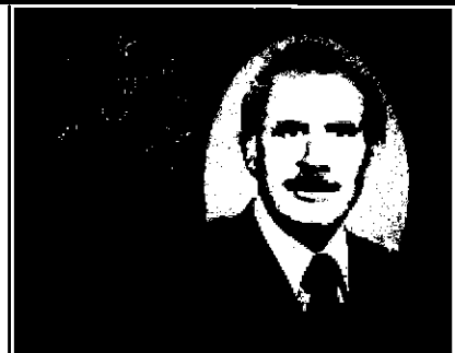
International scandal breaks out at the People's Palace (below) involving Afghanistan's fearless leader Taraki (above), and a filthy traitor (not pictured).

Chaos ensued with men yelling and acrid smoke invading my lungs, but what I remember most is the smell. The air reeked of copper, which I learned is the smell of blood. As the air cleared and the moans of the wounded men subsided, it became abundantly clear to those gathered that the unfaithful bastard Amin had gotten away, cheating death yet again. He would not escape justice however, as a few months later, the mighty Soviets stormed the palace and found the weakling trembling in a corner. He was an arrogant fool thinking he would escape the wrath of his powerful enemies. Long live Taraki, and long live Leonid Brezhnev.