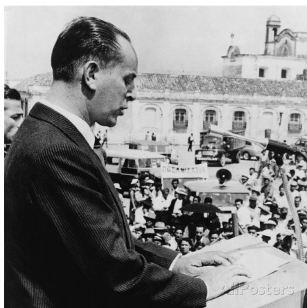
Jacobo Arbenz Resignation Speech